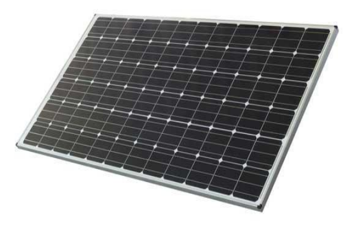
Fig. 2 solar module

Also called solar panels, a solar module may be a single photovoltaic panel that's an assembly of connected solar cells. The solar cells absorb sunlight as a source of energy to get electricity. An array of modules is wont to supply power to buildings. A solar module is generally consisting of an assembly of 6x10 solar cells. The solar cells' efficiency and wattage output can vary counting on the sort and quality of solar cells used. A solar module can home in energy production from 100-365 Watts of DC electricity. The higher is the wattage output, the more energy generation per solar module. A solar battery of modules consisting of upper energy-producing solar modules will, therefore, produce more electricity in less space than an array of lower producing modules. However, the cost is higher for greater producing modules.