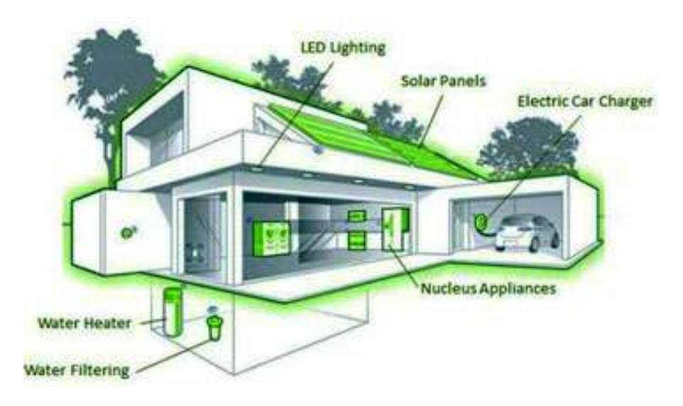
Fig. zero energy building layout