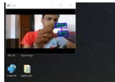
Fig. 5. This is the part of the code where it identifies the multiple inputs from the user that can help for the creation of the mouse pointer movement.

Here in the fig 4 we are seeing a single figure input provided to the camera feed, what we can observe is that the mask which is created is based on the color Green. This works based on the color detection code that is provided to distinguish the back ground with green. This is a sample representation with a single input from the user. Now let's see how it will work for the different ways of inputs.