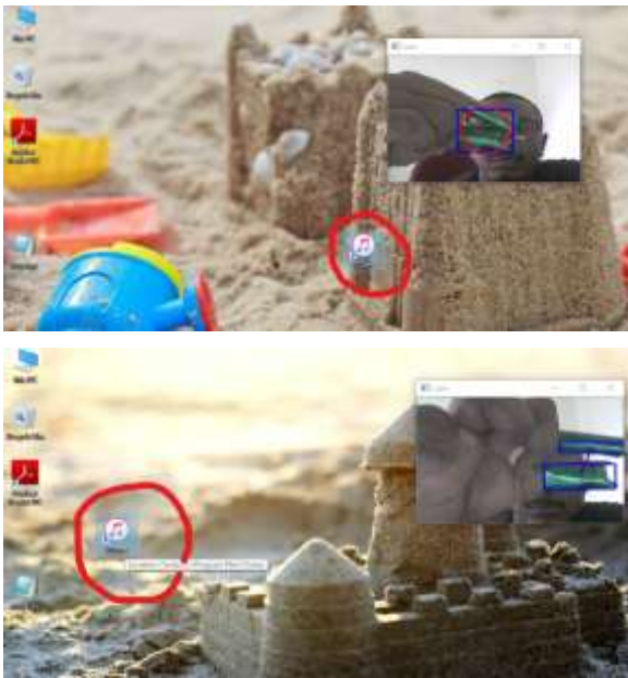
Fig. 6 & 7. In here the system implementation and working where we have selected an application like iTunes and tried moving using our mouse model.

Same way we can observe the things like clicking which is formed from combining both the figures. So the working of this is based on the circle that is formed combining two rectangles that is formed from the detection of the green color in front of the camera.