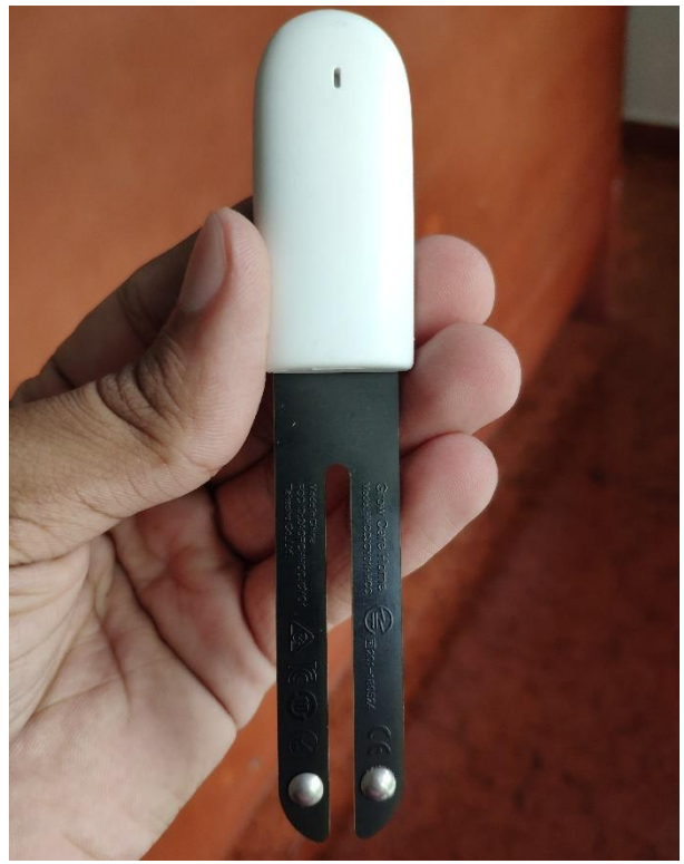
Fig - 2: Crop Monitoring Tool