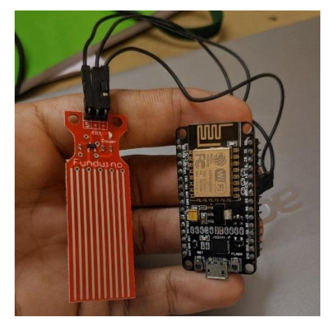
Fig- 5: Water Level Sensor with NODEMCU