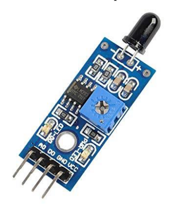
Fig-4: Fire Sensor

A flame sensor designed to detect and respond to the presence of fire, here we are using an IR based flame sensor, when it detects the fire it will instantly notify the farmer through the app also trigger automatic water sprinkler placed in the farmland to put out the fire.