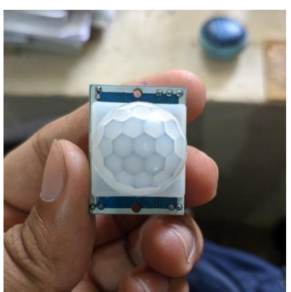
Fig- 3: PIR sensor