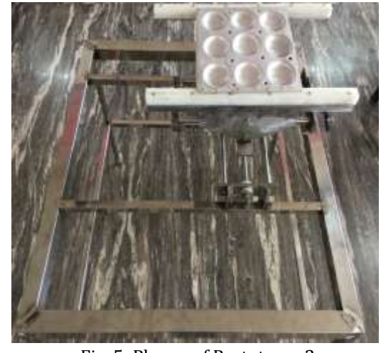
Fig. 5: Phases of Prototype- 2