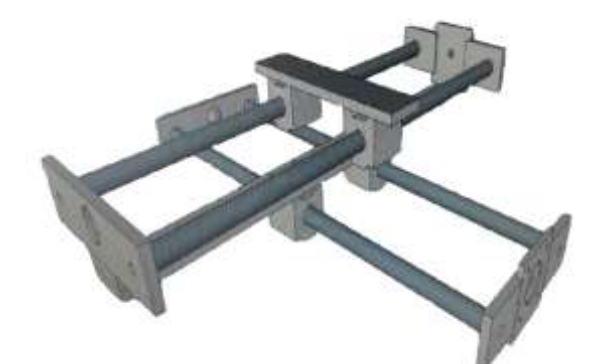
Fig. 3: Design of Cross-Slide