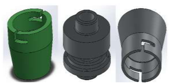
Fig.2: Elements of Design Phase