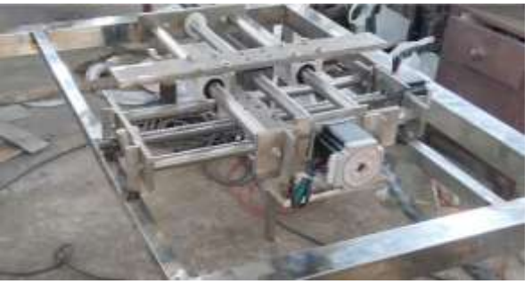
Fig. 4: Phases of Prototype-1

The actual model is the real world model of the project. The actual model has some quintessential modifications from the proposed model. The major modifications include the changes in frame and sub structure, size etc. The changes are introduced to the system in order to incorporate the components like Stepper Motor, Motor Drives, Power Supply Unit, and Arduino Microcontroller etc. There are other changes in case of the components like Cross-Slide, Idiyappam Press, and Steaming Chamber etc. All the modifications over the designed model were done and analyzed using the SolidWorks. Inc. 2016. Phases during Productization are depicted below in Fig 4,Fig 5,Fig 6