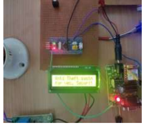
Fig.2 Title of our project