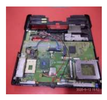
Fig-3: Over all view of project module

The current design is an IOT application, which will continuously monitor laptop and report the status of the laptop .we can locate the laptop around the globe with microcontroller, GPS, GSM module. The laptop can be tracked even it is in OFF state.