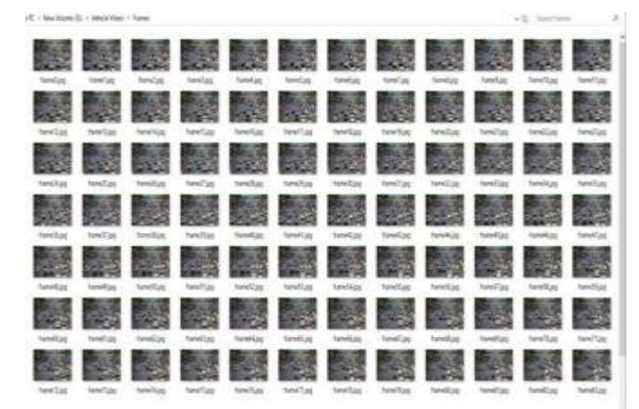
Fig-4.1: Frames extraction

• Video uploading: In this phase video from local directory will be loaded into the application. In this module the frames will be extracted as shown in Fig-4.1 from the uploaded video by considering the bit rate and the components value of the video.