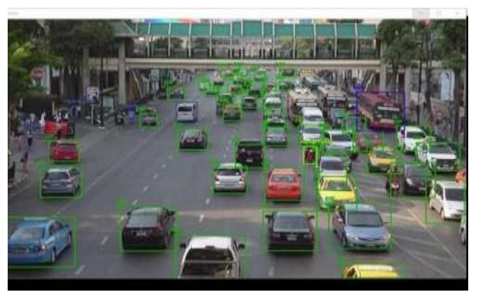
Fig-4.2: Object detection

• Object detection: In this module each and every frames that has been extracted will be undergoing a series of data manipulation where the frame value will be exercised from x-axis and y-axis and the object weights will be calculated for the object that has been detected as shown in Fig-4.2.