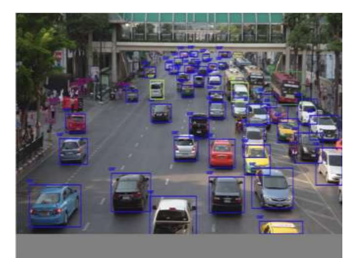
Fig-4.3: Object matching

• Object matching: Whatever the object that has been matched into the frame is compared with the vehicle object dataset and its weights are matched then it will be controlled as a vehicle as shown in Fig-4.3.