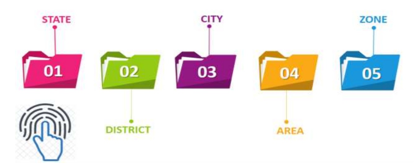
Figure - 2