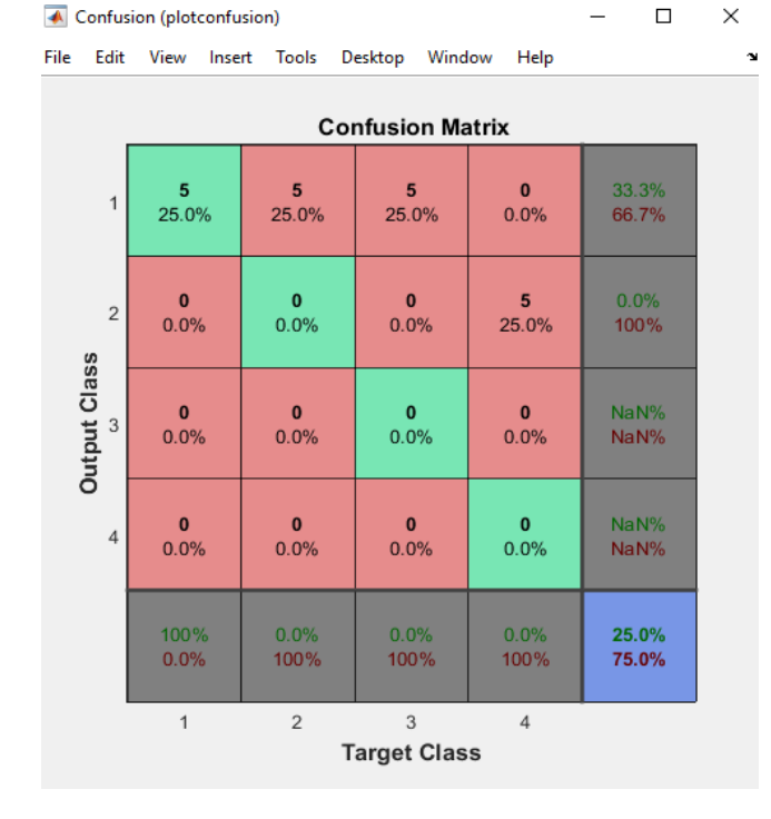
Figure-5: Confusion Matrix using combined features for fake Mustard Seed Testing