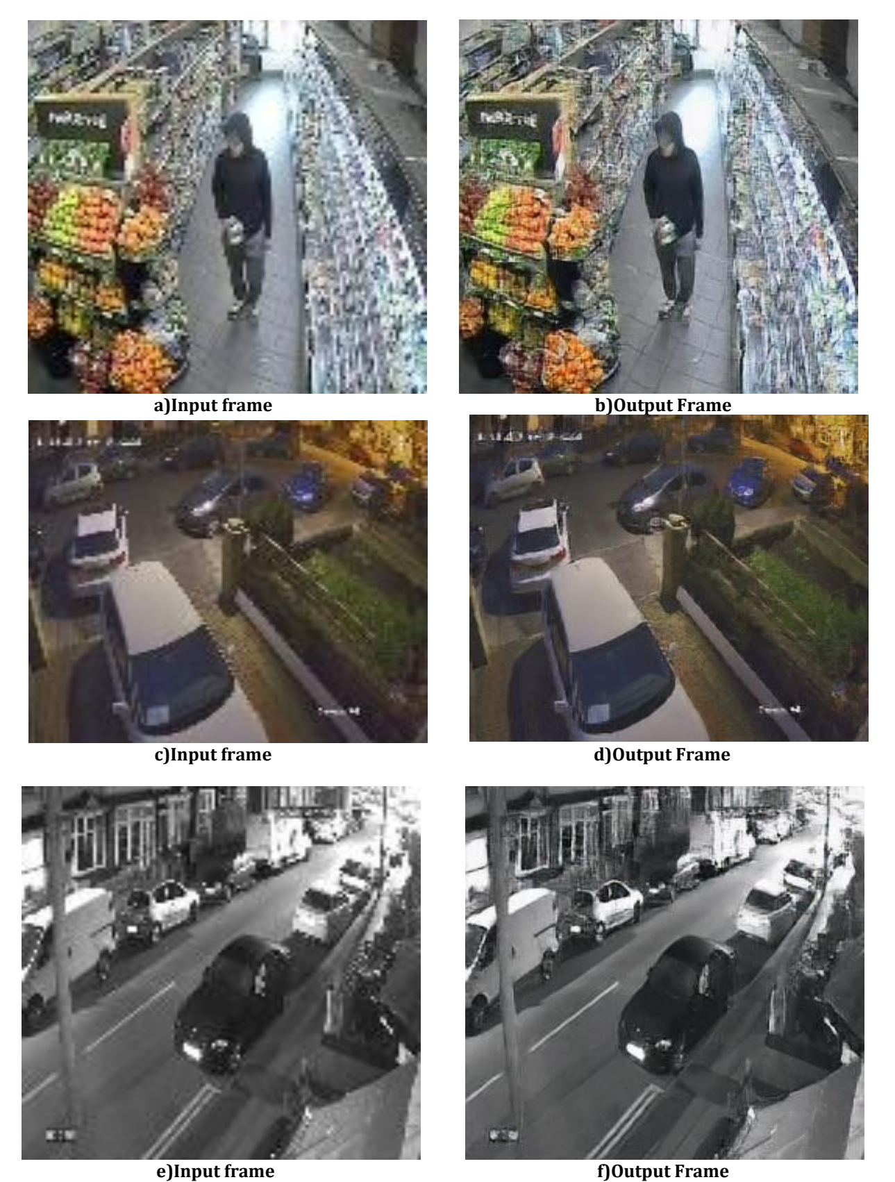
Figure-2 Frames captured using surveillance system (a,c,e) and the enhanced version of the image in the frame using the proposed model (b,d,f)