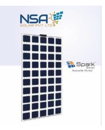
Fig -3: BIPV panel