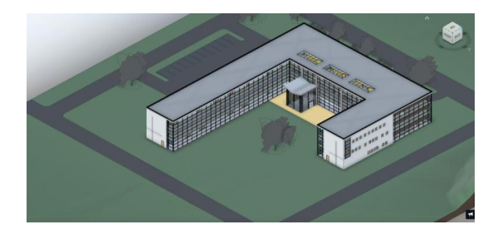
Fig -2: 3-D model of a school building