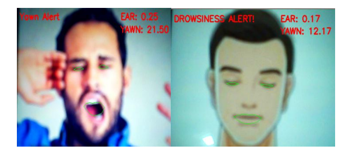
FIG - 5: Detection of Drowsiness