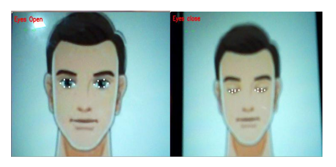
FIG - 4: Detection of Eye Close and Eye Open

Driver's drowsiness and fatigue nature can be detected by using Drowsi care system. The system comprises of a camera attached with an alarmwhich is placed in front of driver and fixed inside the car. The camera records the video of the driver's facial expressions for observing the drowsiness. The continuous video frames captured by the camera will be compared with the trained data sets. The trained data sets consists of collection of various images with open and closed right and left eves along with mouth during yawning. If the continuous video frames that are captured by the camera matches with the images in the trained data sets then an alarm will be blown. The alarm indicates that the driver is in fatigue state or he is about to sleep i.e indicates the drowsiness. This alerts the driver and other co-passengers in the vehicle and the alarm will stop only when driver facial expressions comes to normal.Thus Drowsi care system prevents accidents and ensures safe driving by detecting driver's drowsiness.