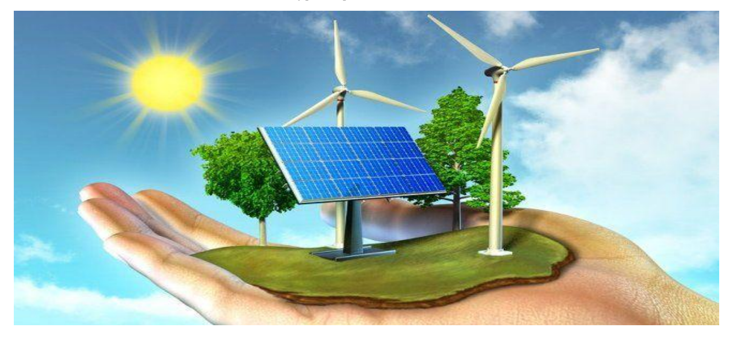
FIG-1.1 RENEWABLE ENERGY

The advancement in the renewable energy sources is replacing the dirty fossil fuels in the power sector, which in return gives the benefit of lower emissions of carbon and other types of pollution.