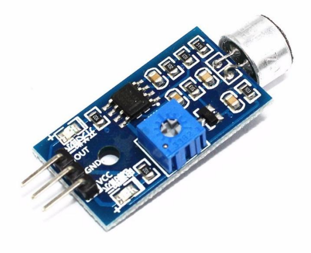
Fig4 LM393 sound sensor module