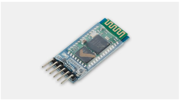
Fig3 HC-05 Bluetooth Module