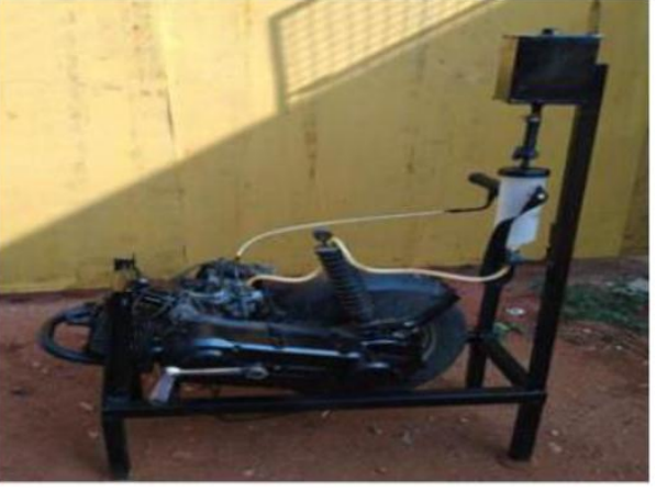
Fig.2- Fabrication of the planned model