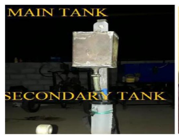
Figure-1 shows the design of the secondary tank used to moderate the flow of fuel from the tank. Based on the design made, a model was fabricated using an TVS scooter 60cc 2 stroke engine incorporated with secondary tank. Figure-2 shows the fabricated model.