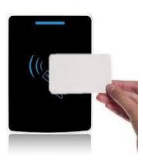
FIG.7. RFID TAG SCANNED USING RFID

The donor is requested to scan the RFID card over the reader so that the information of the card can be extracted. Figure 7 shows the process of reading RFID card.