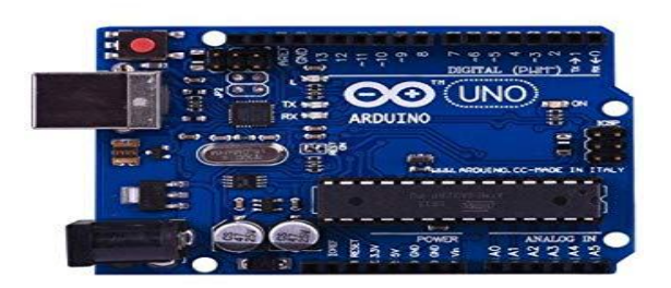
Fig 2 . Arduino Uno Board

Arduino Uno is ATMEGA328 based microcontroller. It can be powered via power supply as well as USB connection. It has 6 analog, 14 digital pins and Reset button. Fig 2 shows the Arduino Uno Board.