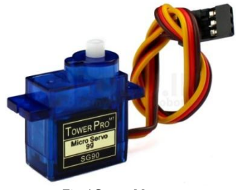
Fig 4.Servo Motor

Servo Motor allows precise control over angular acceleration and angular position. There are 3 pins in Servo motor out of which two are used for power supply and one for the digital input. Servo motors are used in automated machinery and robotics. Figure 4 shows the Servo Motor.