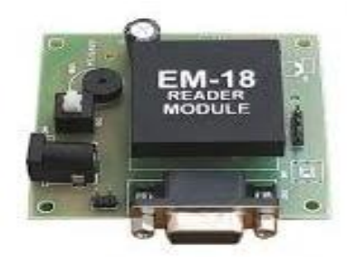
Fig -3: RFID Reader module

It works in the similar manner to Barcode technology. A Radio Frequency Identification reader is used to keep track on individual objects or items.