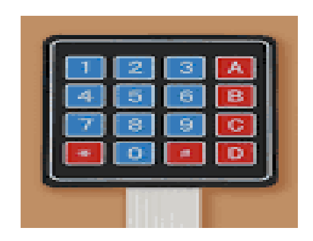
Fig -6: Keypad

Keypad is arrangement of switches in matrix format in rows and columns. They are used in many of the applications. In our project it is used by the user to enter the quantity of medicine and to choose which type of medicine they need from the given list of medicines.