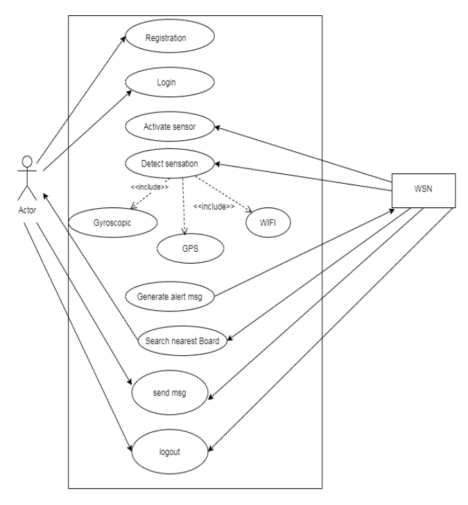
Fig.6.1 Use Case Diagram

Here we are Define a use case diagram, which is indicating the whole project history. In the diagram, there are many actors and cases are involved. Each case represents a unique function of project like registration, Sensor Activation, Notification etc. Here we focus on real time sensor like Gyroscopic, GPS, WIFI etc.