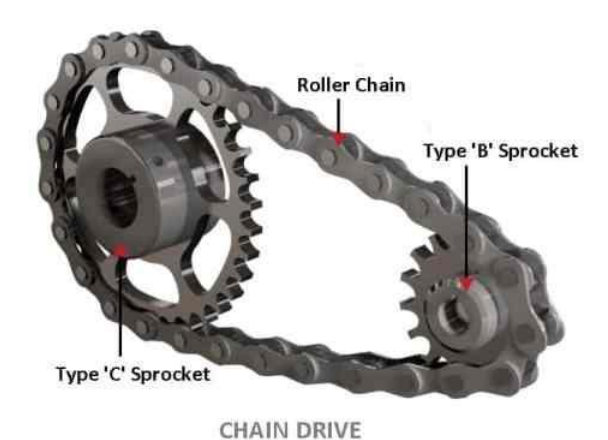
Figure 2.3 Chain Drive

5. Chain Drive: A Chain is an array of links held together with each other with the help of steel pins. This type of arrangement makes a chain more enduring, long lasting and better way of transmitting rotary motion from one gear to another. The major advantage of chain drive over traditional gear is that, the chain drive can transmit rotary motion with the help of two gears and a chain over a distance whereas in traditional many gears must be arranged in a mesh in order to transmit motion.