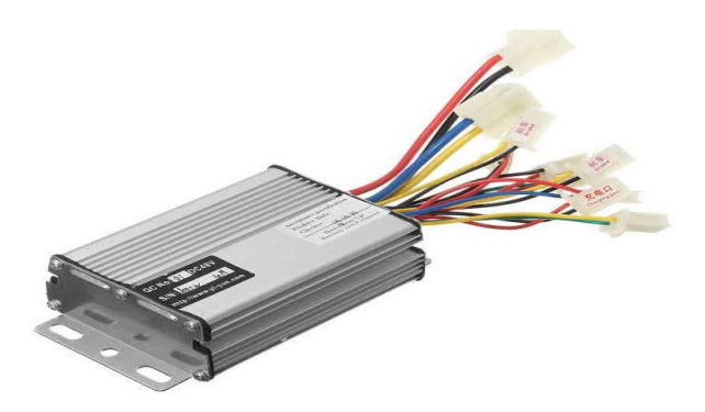
Figure 2.4 Motor Controllers

A motor controller might include a manual or automatic means for starting and stopping the motor, selecting forward or reverse rotation, selecting and regulating the speed, regulating or limiting the torque, and protecting against overloads and faults. Every electric motor has to have some sort of controller. The motor controller will have differing features and complexity depending on the task that the motor will be performing. The simplest case is a switch to connect a motor to a power source, such as in small appliances or power tools.