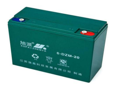
Figure 2.2 Lead-Acid Battery

4. Battery: The battery also acts as a condenser in a way that it stores the electric energy produced by the generator due to electrochemical transformation and supply it on demand. Battery is also known as an accumulator of electric charge. This happens usually while starting the system.