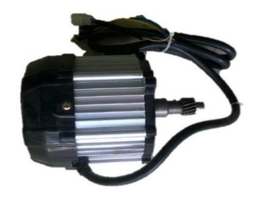
Figure 2.1 E-Bike Motors

1. DC motor: The motor is having 250 watts. capacity with maximum 2100 rpm. Its specifications are as follows: Current Rating: 7.5amp Voltage Rating: 48 Volts Cooling: Air – cooled Bearing: Single row ball.