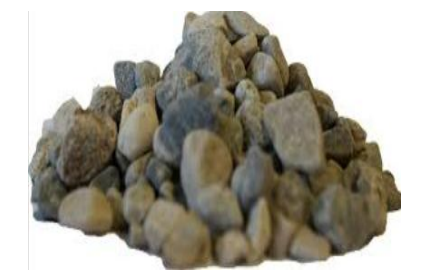
Fig. 3 Coarse Gravel [8]