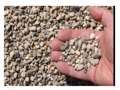
Fig. 2 Fine Gravel[8]

These layers have the key role in the filtration process and the expected outcome will be only possible by the significance performance by this predominant layers. It is basically a vertical filter, framing layers of fine and coarse gravel. The holding capacities of gravel to resist the passage of the suspended solid particles in the grey water reduce the contamination of the corresponding water and accelerate the following mechanisms. The water percolates down to the next layers under gravitational pressure and the process takes place in the gravel layers, limiting the level of contamination in the greywater. A 30cm distribution layer of fine gravel, 8-20mm diameter and another 30cm layer of coarse gravel of grain size 20-30mm are provided for the design setup. The image of the fine and coarse gravel are shown below in Figure 2 and Figure 3.