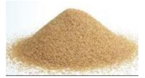
Fig. 5 Fine sand[2]

The predominant contribution of framed sand layers accelerates the performance of the filtration unit. The grading of the sand selected for the layer arrangement should be correct in order to exhibit the excellent output from the filtration system. The resistive nature and the holding capacity of the pores in the sand layers make them useful for the water filtration in every aspect. The filter layer of coarse sand, minimum 60cm in depth and the fine sand should be 0-4 mm, while in the case of coarse 4-8mm. The images of the fine sand and coarse sand are shown below in Figure 5 and Figure 6.