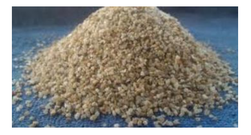
Fig. 6 Coarse sand[2]