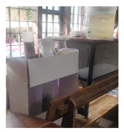
Fig.10 working model of filtration system

The water collected from the two tanks is further subjected to the disinfection process using the bleaching powder. The treated water then used for the domestic purposes such as car washing, gardening, bathroom flushing [1]. The experimental designs under working condition of the filtration system are depicted in the figure 10.