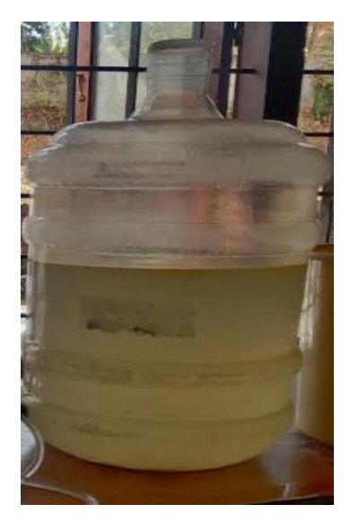
Fig.9 Greywater collected

The water collected from the two tanks is further subjected to the disinfection process using the bleaching powder. The treated water then used for the domestic purposes such as car washing, gardening, bathroom flushing [1]. The experimental designs under working condition of the filtration system are depicted in the figure 10.