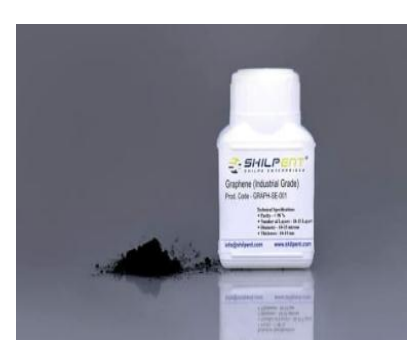
Fig. 8 graphene powder (industrial grade)

The higher cost of graphene is one of the major crises that we faced in the construction of the system .But the removal efficiency of the material with the trace amount of it makes more applicable. For the miniature setup of this system, we adopt 10gm of the graphene powder (industrial grade product). The image of the material is shown in Figure 8 depicted below.