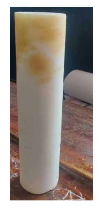
Fig. 12 filter cartridge after filtration

The water after the filtration is also analyzed in the laboratory in order to verify the changes in the contamination level. Significant changes in water characteristics especially the color and odor indicates the reduction in the biodegradable and non-biodegradable pollutants in the water[5]. The average pH of water significantly reduced from 8.6 to 7.2. Turbidity, one of the major factors reduced from 266 NTU to 23.5 NTU. The obtained result shows that the method exhibits excellent performance in the removal of organic and inorganic pollutants. The figure 12 shown below indicates the identifiable reduction in the amount of dust particles and color even in the first stage of filtration method.