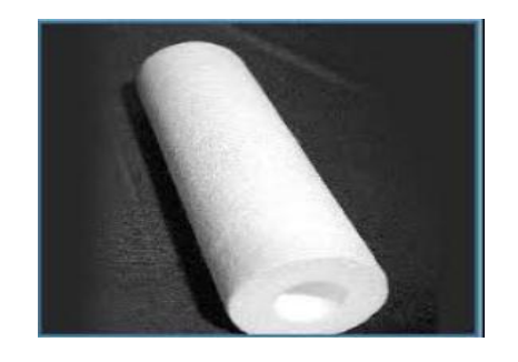
Fig. 1 Polypropylene Filter Cartridge[9]