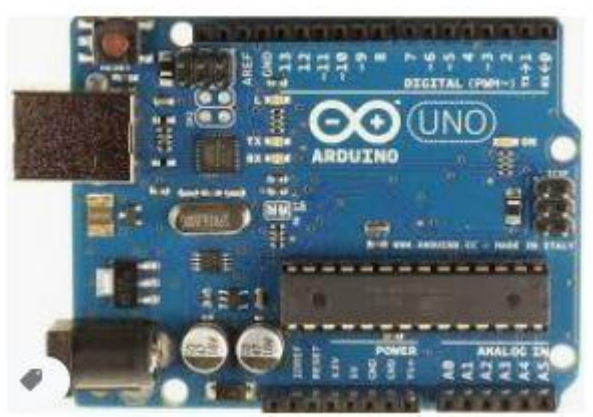
Fig. 2. Arduino UNO

(I/O) pins that may be interfaced to various expansion boards or breadboards and other circuits. The boards feature serial communications interfaces, including Universal Serial Bus (USB) on some models, which are also used for loading programs from personal computers.