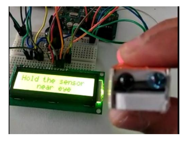
Figure 4: Module of the project.

output voltage of the sensor increases in transmittance mode and decreases in reflectance mode. Moreover, for the blood pressure the output voltage of sensor decreases in transmittance mode and increases in reflectance mode