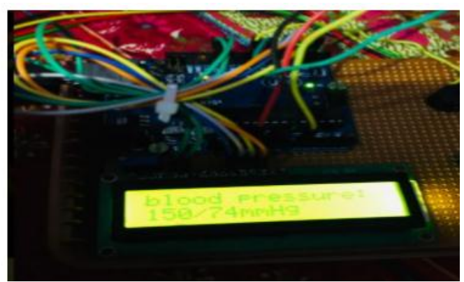
Figure 6: Blood pressure output seen in the LCD.