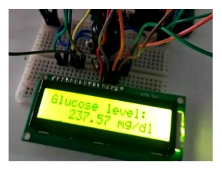
Figure 5: Glucose concentration being seen in the LCD.