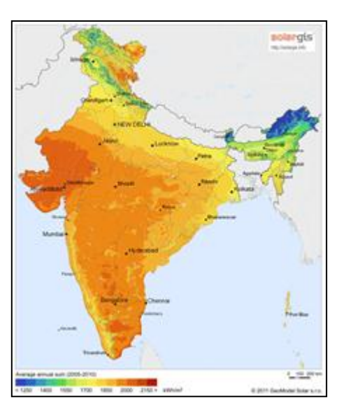
Fig.3: India's solar radiation map (2011)

Punjab, Haryana, Uttar Pradesh, Bihar, West Bengal.