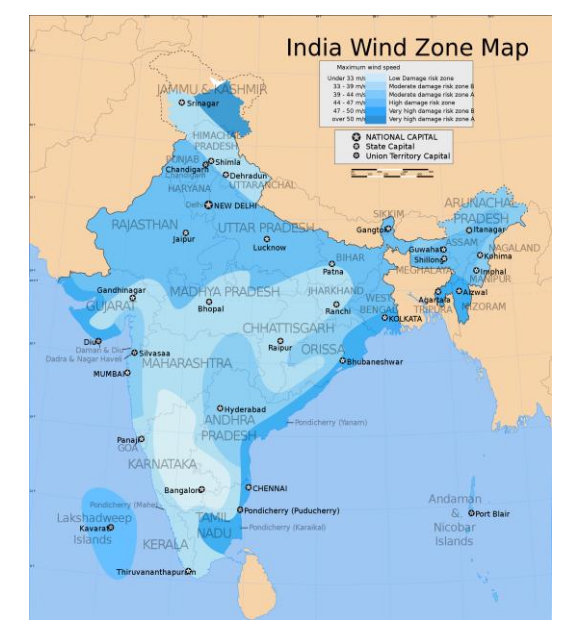
Fig.1: India wind zone map (2011)