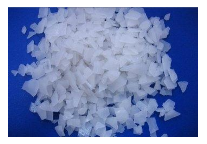
Figure 3.3: Sodium hydroxide

Sodium hydroxide is an inorganic compound. A metallic base Alkali salts of Highly caustic white solid materials available in flake or granules pellets or and which are prepared as different concentration of solution. Approximately 50% of saturated solution with water forms Sodium hydroxide ( by weight).