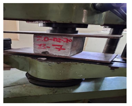
Fig 4: Compression test