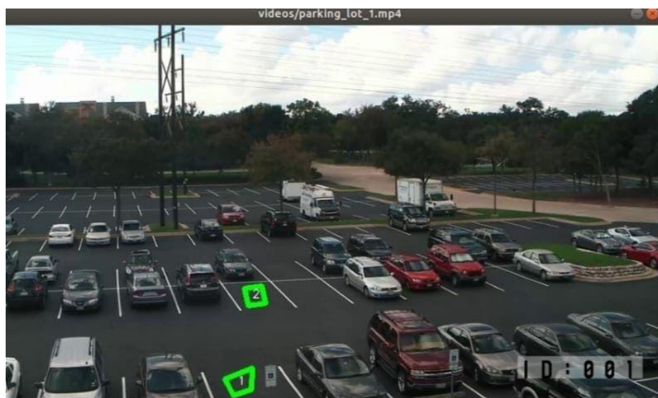
Fig-2 Slots monitored and unoccupied indicated by green

The camera modules are triggered each time the main program updates the slot details which then sends out an mp4 recording of the current slot, on which all these processes are performed, figure2 shows the slots which are empty which is represented by green boundary and occupied slots represented by a red boundary in figure 3 when the video is being analysed. Figure 4 shows how the user gets the real time slot details of the parking area.