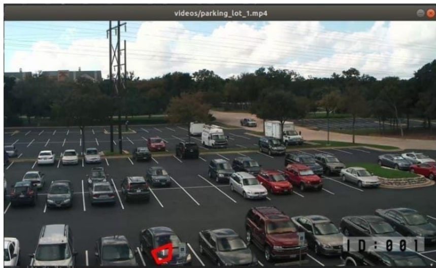
Fig-3 Slots monitored and occupied indicated by red