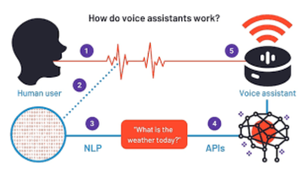
Fig-1 : Working Of Voice Assistant

For the voice-enabled world so-called smartspeakers have shown to hold a lot of potential. These have a microphone to