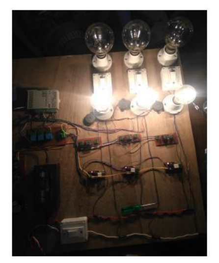
Fig -2: Expected Scenario