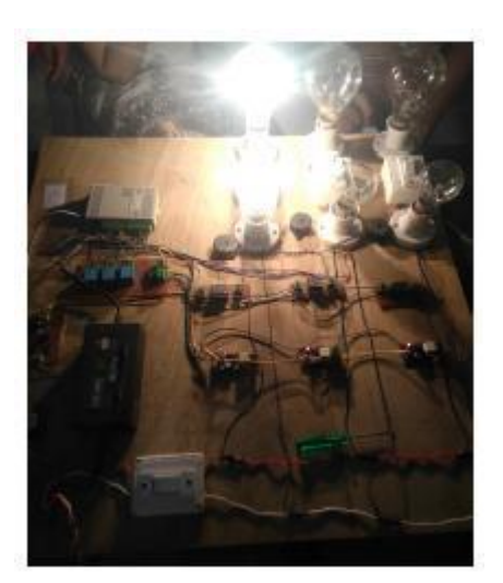
Fig -3: Cut Off Condition