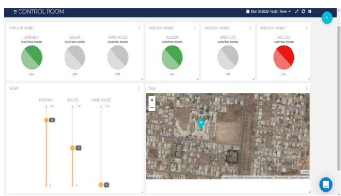
Fig -4: Control Room Dashboard