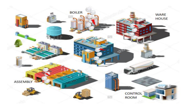
Fig -3: Industrial Setup