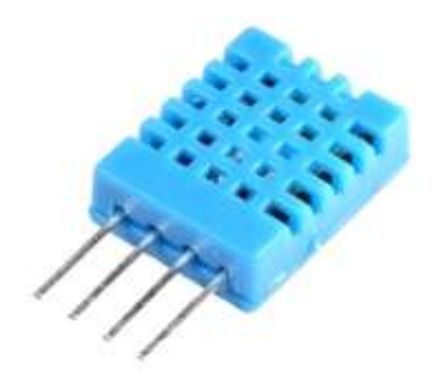
Fig 3:Humidity sensor

Humidity Sensors are the low cost-sensitive electronic devices used to measure the humidity of the air. These are also known as Hygrometers. Humidity can be measured as Relative humidity, Absolute humidity, and Specific humidity.