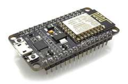
Fig 2: ESP8266 WIFI module

NodeMCU is an open source IOT platform. It initially included firmware which runs on the ESP8266 Wi-Fi SoC from Espresso Systems, and hardware which was based on the ESP-12 module. Later, designs based on the ESP32 32-bit MCU were added. Instead of using Arduino and GSM separately this NodeMCU offers both functionalities in it itself.