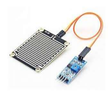
Fig 4: rain sensor

Rain sensor or rain switch is a switching device activated by rainfall. It works like a switch and the working principle of this sensor is, whenever there is rain, the switch will be normally closed. It is connected to the NodeMCU or Arduino UNO.