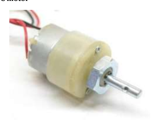
Fig 5: Dc motor

DC motor is any of a class of rotary electrical machines that converts direct current electrical energy into mechanical energy. The most common types rely on the forces produced by magnetic fields. Nearly all types of DC motors have some internal mechanism, either electromechanical or electronic, to periodically change the direction of current in part of the motor.