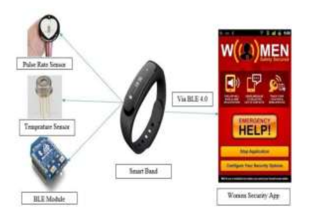
Fig 2. 1 proposed system

Volume: 07 Issue: 04 | Apr 2020 www.irjet.net p-ISSN: 2395-0072