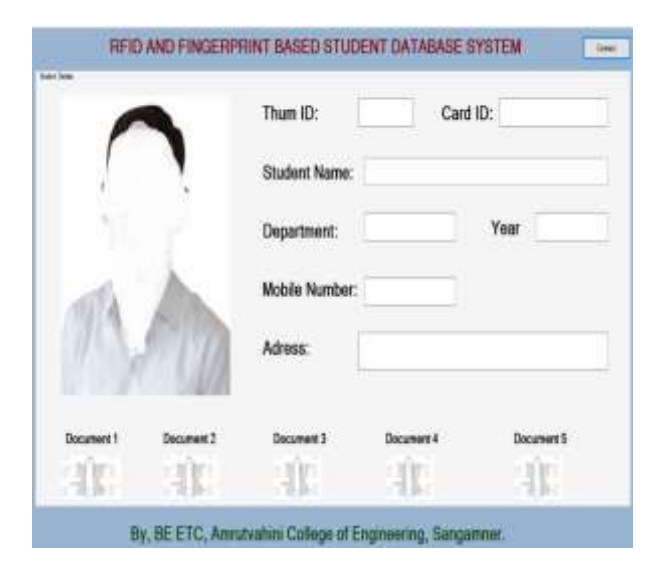
Fig-4: RFID and fingerprint based student database system

In this, firstly student has to insert the RFID card as well as give the fingerprint, if the software having students information then it shows valid user otherwise it shows invalid user. Because we already store the information about the students in MT2 software, if the user is valid then it shows the students name, year, mobile number and address of the student. Then we can access the documents as shown in output window.