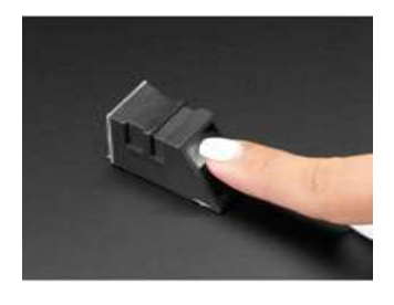
Fig -1: fingerprint module

University server, Government server [2] The purpose of this project is to create an RFID-based information system that allow students to access or retrieve information using their RFID in this system the RFID reader reads the id number from passive tag and sends it to the microcontroller, if the id number is valid then only it gives the access to the fingerprint scanner otherwise it stops the process, if the fingerprint is matched then microcontroller identified the valid person.