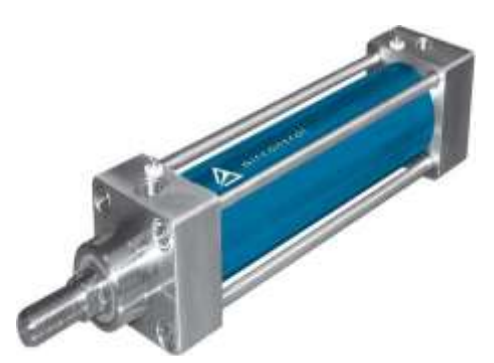
Fig -4: Pneumatic Cylinder

2.3. PNEUMATIC SINGLE ACTING CYLINDER: The cylinder is a Single acting cylinder one, which means that the air pressure operates forward and spring returns backward. The air from the compressor is passed through the regulator which controls the pressure to required amount by adjusting its knob. A pressure gauge is attached to the regulator for showing the line pressure. Then the compressed air is passed through the single acting 3/2 solenoid valve for supplying the air to one side of the cylinder. One hose take the output of the directional Control (Solenoid) valve and they are attached to one end of the cylinder by means of connectors. One of the outputs from the directional control valve is taken to the flow control valve from taken to the cylinder. The hose is attached to each component of pneumatic system only by connectors. The piston is a cylindrical member of certain length which reciprocates inside the cylinder. The diameter of the piston is slightly less than that of the cylinder bore diameter and it is fitted to the top of the piston rod. It is one of the important parts which convert the pressure energy into mechanical power.