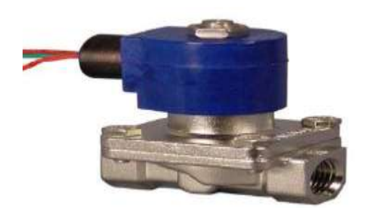
Fig -3: Solenoid Valve

rocker actuators. The valve can use a two-port design to regulate a flow or use a three or more port design to switch flows between ports. Multiple solenoid valves can be placed together on a manifold. Solenoid valves are the most frequently used control elements in fluidics. Their tasks are to shut off, release, dose, distribute or mix fluids. They are found in many application areas. Solenoids offer fast and safe switching, high reliability, long service life, good medium compatibility of the materials used, low control power and compact design. [1]