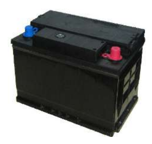
Fig -5: Battery

2.5. Battery: A battery is a device consisting of one or more electrochemical cells with external connections for powering electrical devices such as flashlights, mobile phones, and electric cars. When a battery is supplying electric power, its positive terminal is the cathode and its negative terminal is the anode.<sup>[2]</sup> The terminal marked negative is the source of electrons that will flow through an external electric circuit to the positive terminal. When a battery is connected to an external electric load, a redox reaction converts high-energy reactants to lower-energy products, and the free-energy difference is delivered to the external circuit as electrical energy. [3]