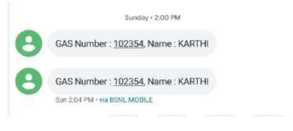
Fig-3: Output send to gas agent

The below figure3 and figure4 represents the output of the project (gas level detection and booking using iot) sent to the gas agent and the output send to the user.