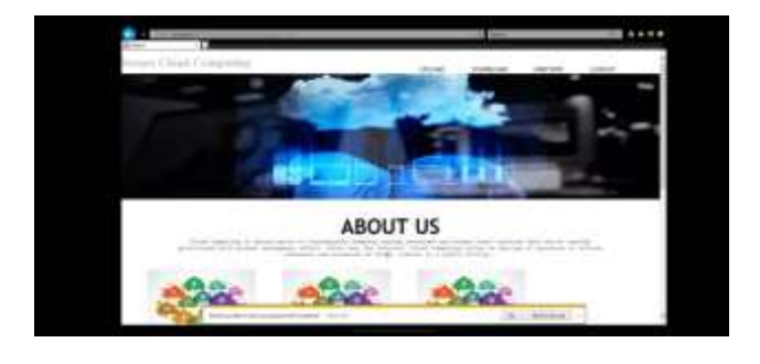
Fig 3 . The User Interface of the Web Application