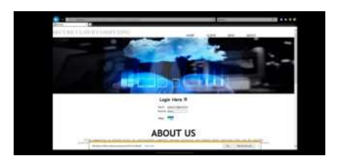
Fig 2(b). Setting up the application