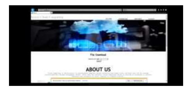
Fig 5. The Recipient can download the file.

This module deals with the encryption of file .the encrypts the file using DES algorithim