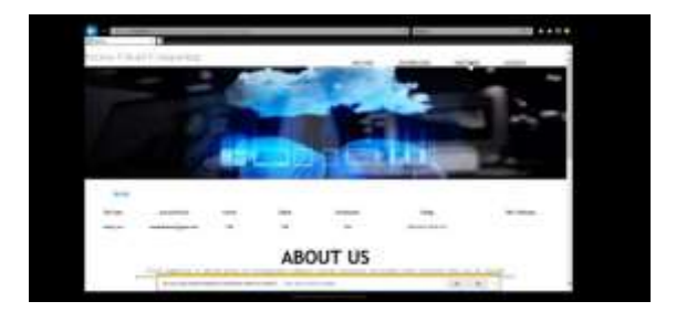
Fig 6. Auditing the data by the client