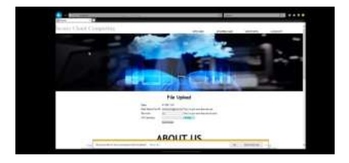
Fig 4. Uploading of file