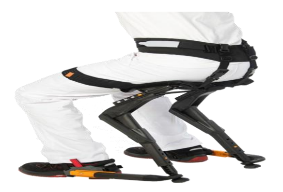
Fig 2: noonee Chairless chair version 2.