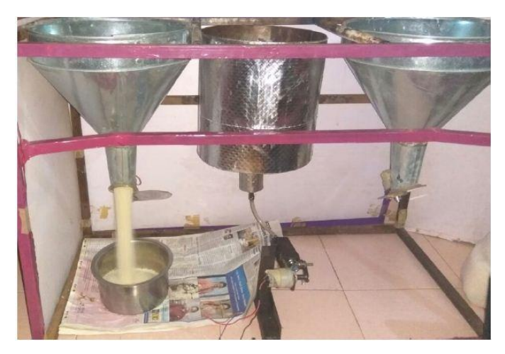
Fig-3: Snapshot of showing 1kg rice being dispensed

Volume: 07 Issue: 04 | Apr 2020 www.irjet.net p-ISSN: 2395-0072