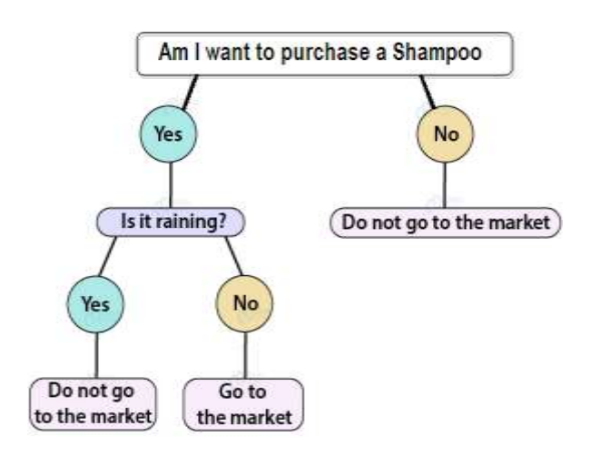
Fig -3: Decision Tree Example

For example if you want to go to the market to purchase a shampoo. First, you will analyze if you really do require shampoo. If you run out of it, then you will have to buy it from the market. Furthermore, you will look outside and assess the weather. That is, if it is raining, then you will not go and if it is not, you will. We can visualize this scenario intuitively with the following diagram Fig-3.