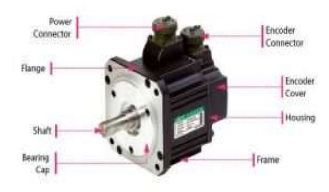
Fig -5: Servo Motor

A servo motor is a rotary actuator or a motor that allows for a precise control in terms of the angular position, acceleration, and velocity. It has certain capabilities that a regular motor does not have. Consequently it makes use of a regular motor and pairs it with a sensor for position feedback. The servo motor is most commonly used for high technology devices in the industrial applications like automation technology. It is a self contained electrical device, that rotates parts of machine with high efficiency and great precision. Moreover the output shaft of this motor can be moved to a particular angle. Servo motors are mainly used in home electronics, toys, cars, airplanes and many more devices. [7]