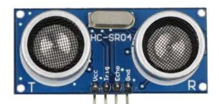
Fig -3: Ultrasonic Sensor

Ultrasonic sensors work by emitting sound waves at a frequency too high for humans to hear. They then wait for the sound to be reflected back, calculating distance based on the time required. This type of sensor can be manufactured in a smaller package than with separate elements, which is convenient for applications where size is at a premium. Ultrasonic sensors have two main components: the transmitter which emits the sound using piezoelectric crystals and the receiver which encounters the sound after it has travelled to and from the target.