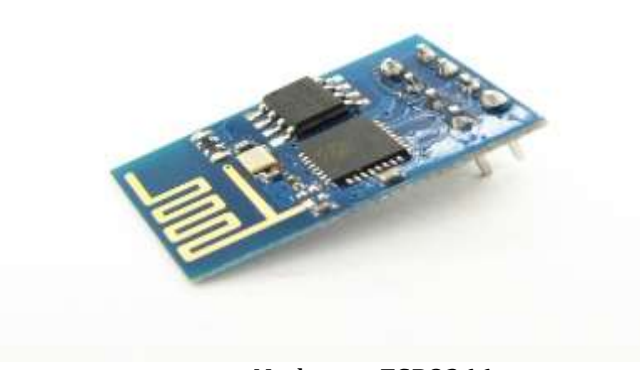
Fig -6: Nodemcu ESP8266