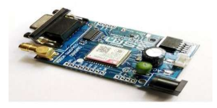
Fig -4: GSM Module

GSM is a mobile communication modem; it stands for global system for mobile communication (GSM). It is a widely used mobile communication system in the world. GSM is an open and digital cellular technology used for transmitting mobile voice and data services. It operates at the 850MHz, 900MHz, 1800MHz and 1900MHz frequency bands. GSM system was developed as a digital system using time division multiple access (TDMA) technique for communication purpose. GSM digitizes and reduces the data, then sends it down through a channel with two different streams of client data, each in its own particular time slot. The digital system has an ability to carry 64 kbps to 120 Mbps of data rates.