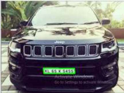
Fig. 3.1.2 Detecting License Plate