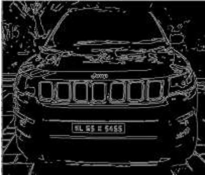
Fig. 3.1.1 Canny Edge Detection