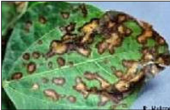
Fig-1. Figure caption of affected leaf.

Bacteria are microscopic, single celled organisms that reproduce rapidly and cause a variety of plant diseases including leaf spots, stem root rots, galls, wilt, blight and cankers. They survive in infected plants, debris from infected plants, on or in seed, and in a few cases, infested soil. Plant pathogenic bacteria cause many different kinds of symptoms that include galls and overgrowths, wilts, leaf spot. Inside host cells In contrast to viruses that are, walled bacteria will grow in the spaces in between cells and do not fully invade them.