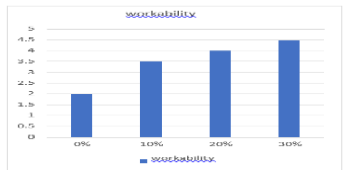
Figure 2. Workability

The 7 day compressive electricity of a well known M25 concrete turned into received as 16.7N/mm 2 and the 28 day compressive electricity was acquired as 25.8N/mm 2 . From the above effects, it's miles observed that the 7-day electricity of 0%, 10%, 20% and 30% is greater than the predicted energy of 15.9N/mm 2 . The 28 day compressive energy with 0% of sand replacement is simplest 26.89N/mm 2 that's lesser than 32.85N/mm 2 . therefore, it's miles discovered that the sand can be competently replaced with glass powder as much as 30%. It may be assessed that the workability of concrete decreases with in percent of glass powder this is because, the water absorption of the glass powder is more than that of sand.