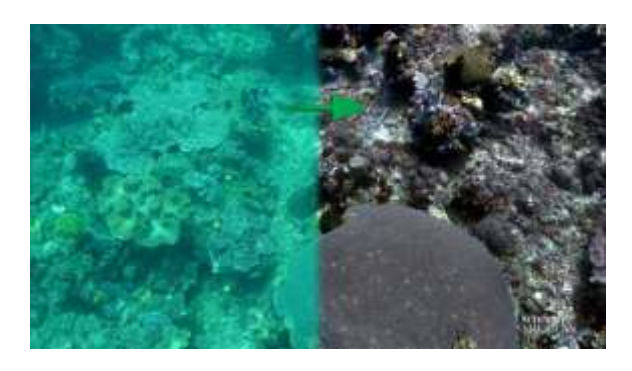
fig.2 example of underwater with result dehazed image

This method does not compute any depth information prior to restoration. Here produce two images prior is pixel based dark and bright channel. Hence the improvement has been given below in figure