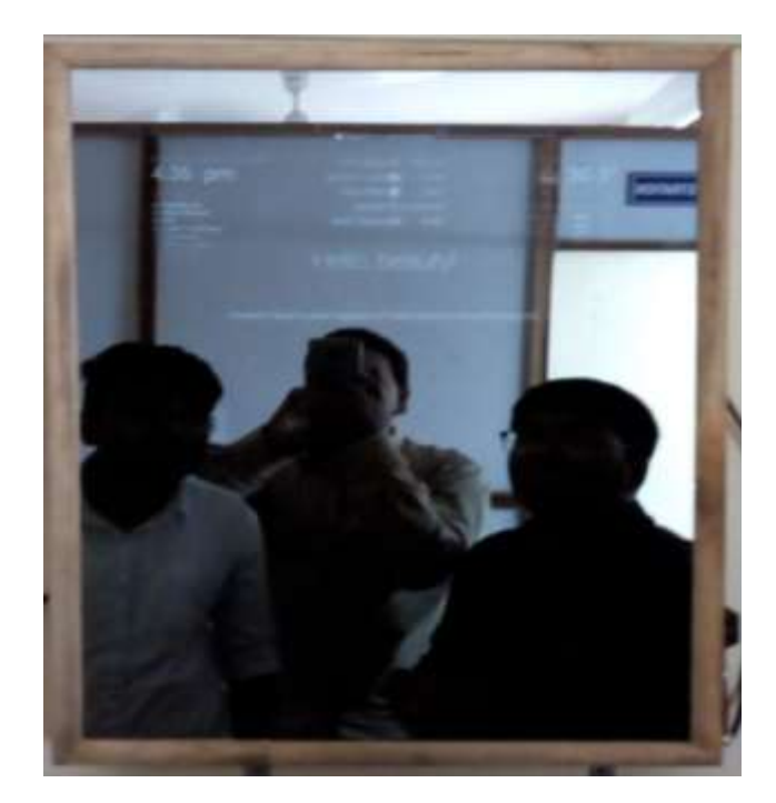
Fig -8: Final look of project

The above Fig-6 shows the setup of the project which consists of a wooden frame, Reflective mirror, An LCD display of 14-inches is mounted behind the Reflective Mirror. There is a VGA-to-HDMI USB convertor that connects LCD screen to Raspberry Pi 4 module. A USB auto gain microphone is used for voice command and A Speaker of 5V 1A is used for voice response. The Raspberry Pi4 module requires a 5V 3A Power supply and the LCD display requires a 12V 1A Power supply.