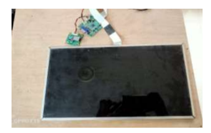
Fig-4: LCD Screen