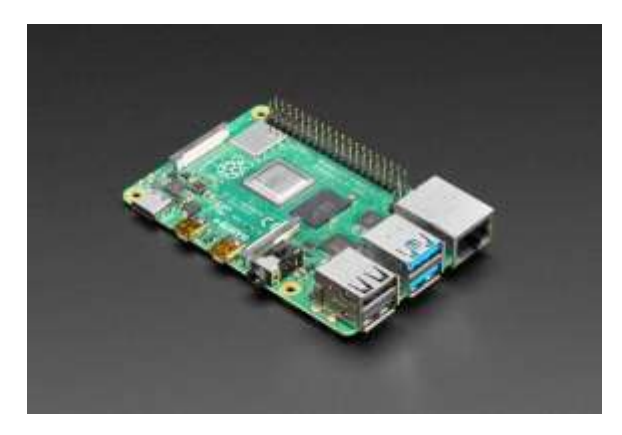
Fig -2: Raspberry Pi 4 Model B

The Raspberry Pi is a Single-Board Computer. It is heart of the Smart Mirror. It is used to make the system interactive and all the processing takes place in this chip-set. It provides the OS required running the Smart Mirror efficiently.