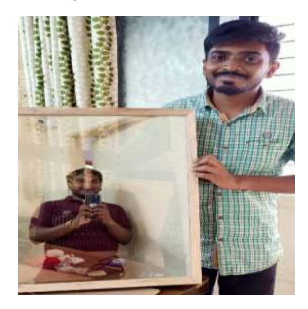
Fig -3: Two-Way Mirror

A two-way mirror, also called one-way mirror (or one-way glass, half-silvered mirror, and semi-transparent mirror), is a reciprocal mirror that is reflective on one side and transparent at the other. The perception of one-way transmission is achieved when one side of the mirror is brightly lit and the other side is dark. This allows viewing from the darkened side but not vice versa.