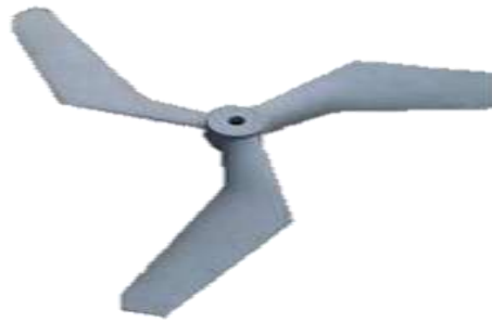
Fig -1 Hand Made HAWT Blades

The main advantages is high generating capacity, improved efficiency, variable pitch blade capacity, and tall tower to capture large amount of wind energy. There are also disadvantages such as consistent noise, killing of birds, interference with radio, TV transmission and radar, land use, maintenance worker hazards and visual impacts .