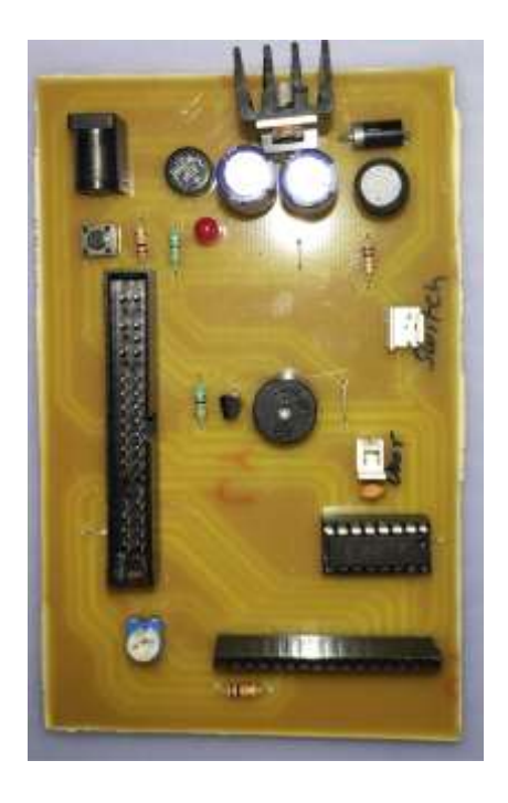
Figure 4: Embedded circuit