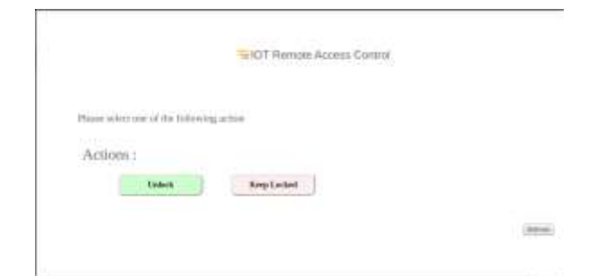
Figure 2: IoTGecko Website