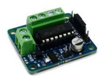
Fig 5: Motor driver

All inputs are TTL compatible. Each output is a complete totem-pole drive circuit, with a Darlington transistor sink and a pseudo-Darlington source. Drivers are enabled in pairs, with drivers 1 and 2 enabled by 1,2EN and drivers 3 and 4 enabled by 3,4EN.When an enable input is high, the associated drivers are enabled and their outputs are active and in phase with their inputs.