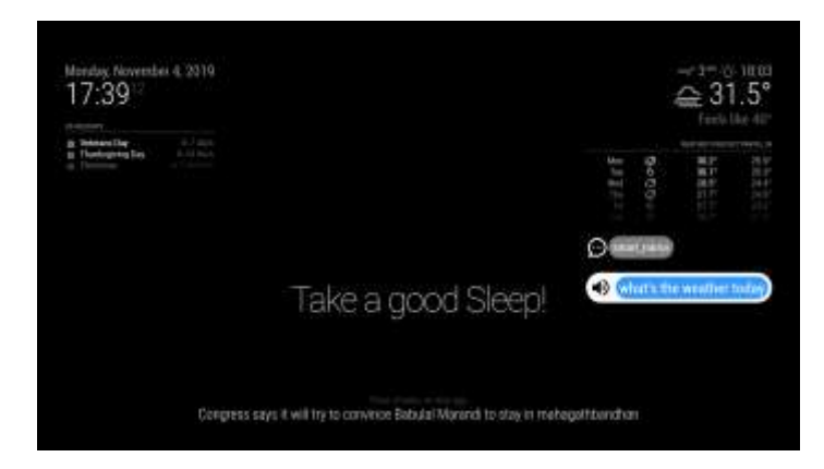
Fig -2: Input

The input in our smart mirror is mainly through the voice commands that it listens and gives results according to it. The tasks include setting a reminder, appointment, meeting and even uses its assistant to view photos through the mirror, the photos that are synced with the user's smartphone.