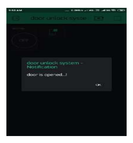
Fig 5. Output window