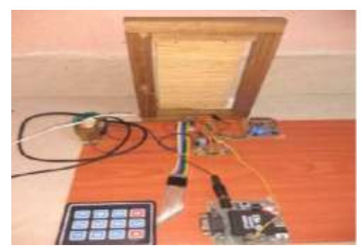
Fig 3.Door is locked