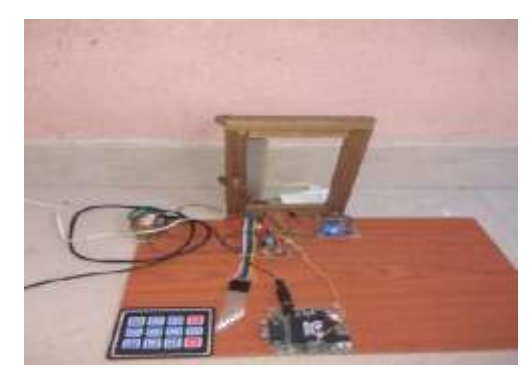
Fig 4. Door is unlocked