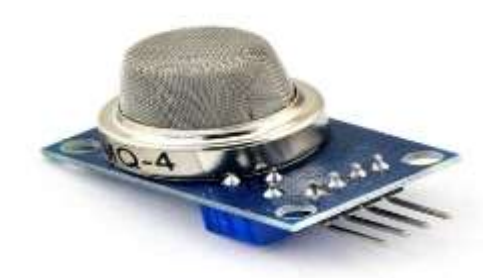
Fig 4 Gas Sensor

It is flexible and reliable that combine technology. The drainage channel are covered with manholes to operate and to clear the blocking present inside the channel.