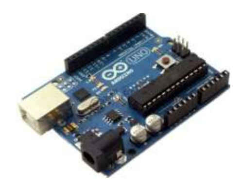
Fig 1 Arduino UNO

Arduino (Fig 1) boards are able to read inputs – light on a sensor, a finger on a button, or a twitter message –and turn it into an output - activating a motor, turning on LED, publishing something online.